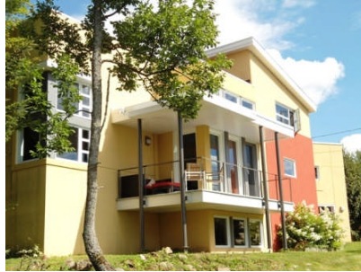
Residence/Office Charest Parenteau